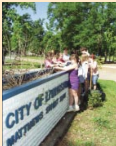
Members of Junior Girl Scout Troop 8121 planted flowers at Matthews Street Park as part of their community service project.