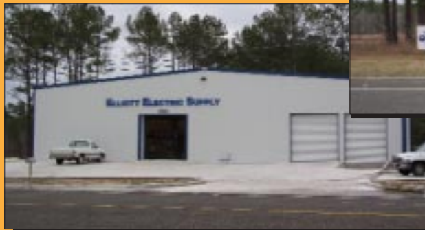
Elliot Electric Supply