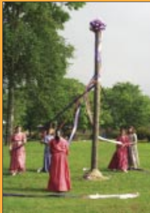
May Pole Dancers at Anniversary Park