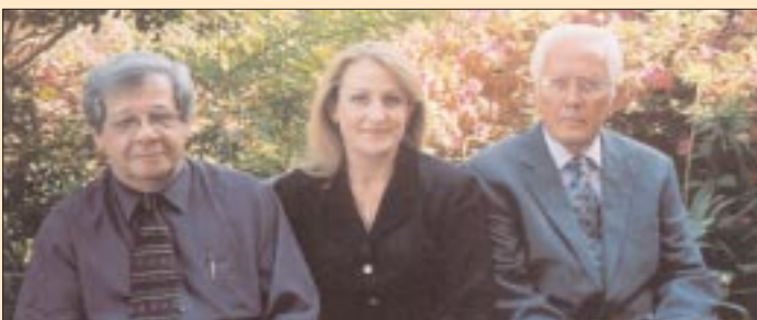
Municipal Court Staff