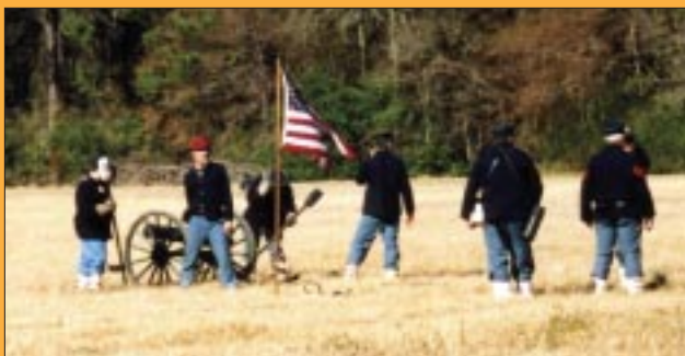
Civil War Reenactment