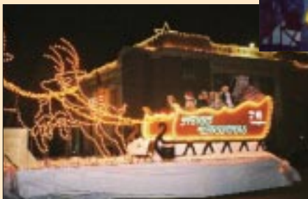
The Street Department's float - Santa's Sleigh - in the Christmas Parade.