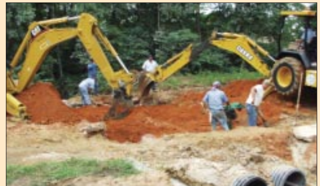
Street improvements on Calhoun Street