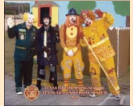
Marty Drake - aka Bunker, the Fire Prevention Clown - presented fire safety education programs to school children in 2003.