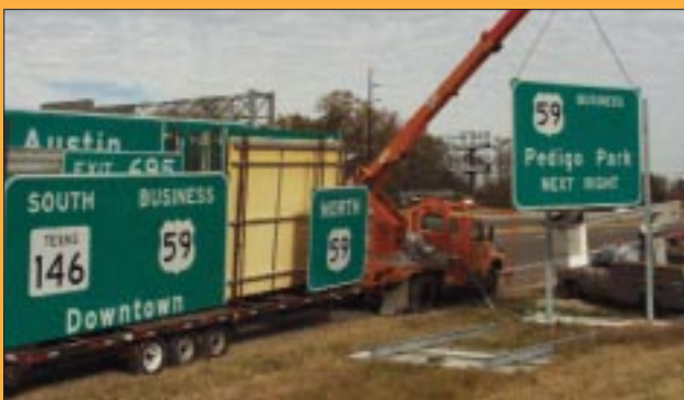
New Signs Installed by the Texas Department of Transportation