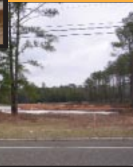
Future Home of Lake Livingston Water and Sewer Offices