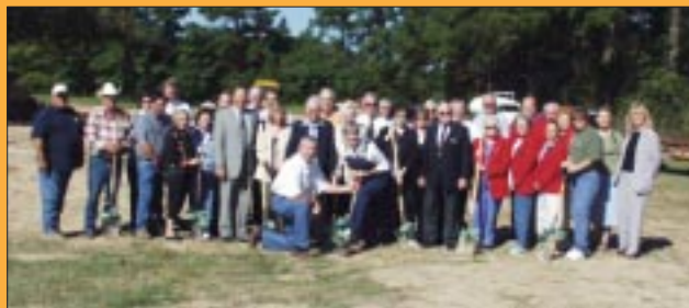
Groundbreaking ceremonies were held on September 29, 2003 to kick off the development of The Retreat in Livingston, a planned community of 39 homes for adults 55 and older. Homes range from 1,500 to 2,000 square feet, most featuring two to three bedrooms.

Polk County is one of the fastest growing areas in Texas. And, Livingston is a significant contributor to that growth. In 2003 alone, the city issued 80 building permits for more than $14 million in construction, creating more than 200 jobs in our community. Now that's breaking new ground!