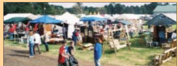
Trade Days at Pedigo Park