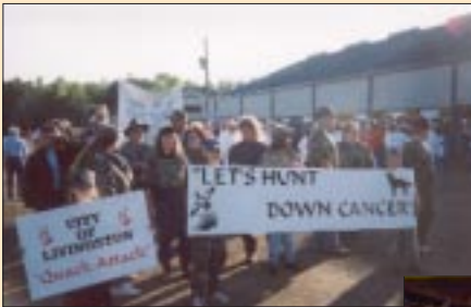
American Cancer Society Relay - Two teams with more than 30 employees participating in the annual fundraiser; Administrative Team "Quack Attack" and Livingston Police Department "Bad Boys."

Each year, many of the city's employees volunteer their time and talents to a variety of local fundraisers, events and charitable organizations.