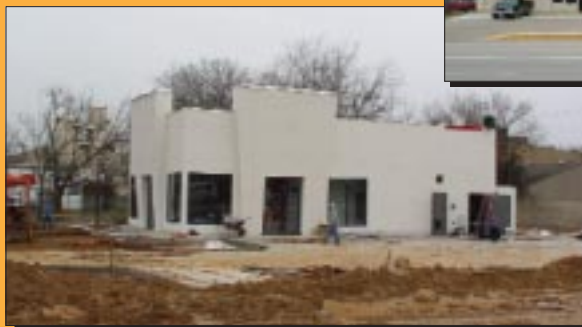
Jack in the Box