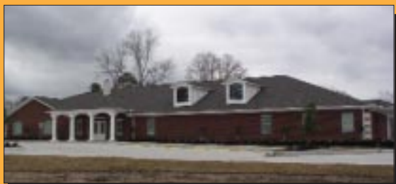
Pace Funeral Home