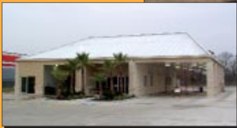
Performance Car Wash