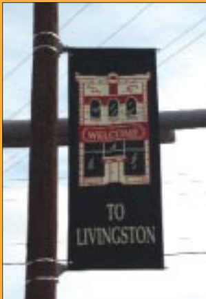
New Welcome Banners

In 2003, the staff concentrated on providing special events for the community as well as attracting tourists to Livingston. In partnership with many community organizations, we hosted our first Civil War Reenactment, participated in a tourism assessment survey and added some flair to downtown Livingston with decorative signage.