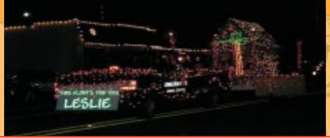
LPD's float wins first place in the Christmas Parade (non-commercial winner).