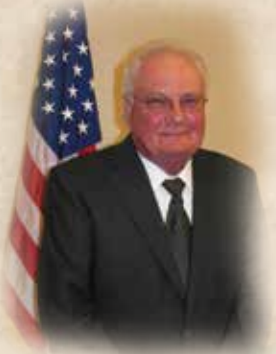
Mayor Clarke Evans