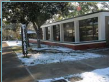
Snow falls on Murphy Memorial Library.