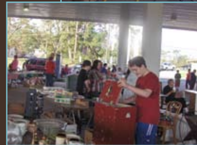
Second Annual Main Street Garage Sale.