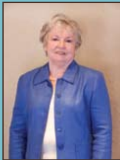
Mayor Pro Tem Judy Cochran.