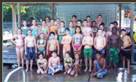
2008 Swim Camp Participants.