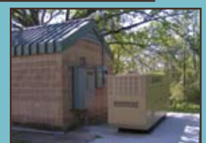
Generator at West Street Water Pumping Station.