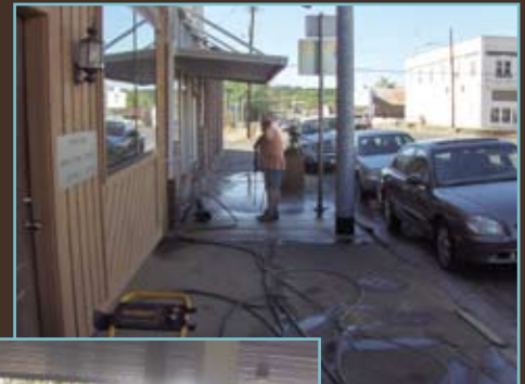
First Community Clean-up.