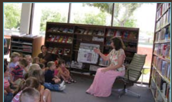
Children enjoy story time at the library.