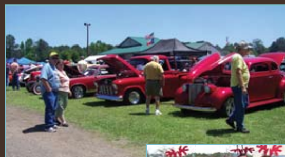
Texas Cruisers Car Show.