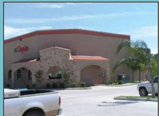
El Taquito Restaurant.