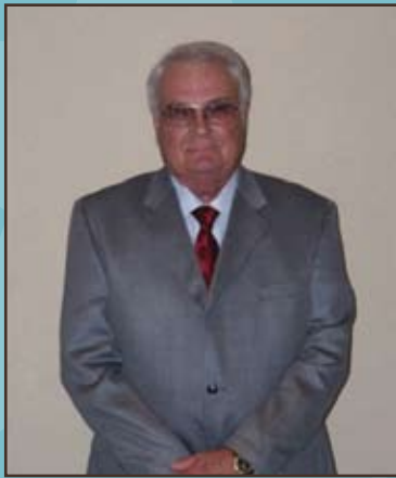
Mayor Clarke Evans.