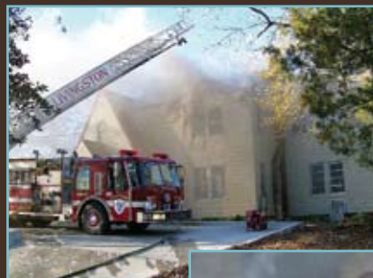
The LVFD fights a fire at the Montessori School.