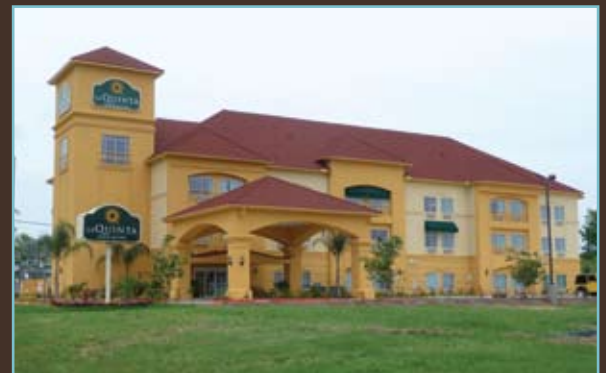
La Quinta Motel.