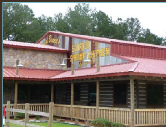
Catfish King Restaurant.