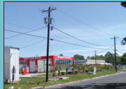
New car wash on Briarway.