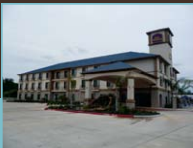
Best Western Motel.