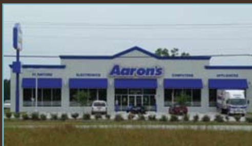
New Aaron's Store.