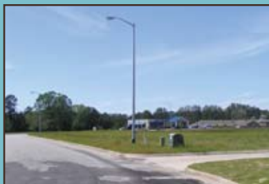
Light poles along West Park Drive.

You never realize how much you rely on electricity until the lights go out. The Electric Department is always dependable , especially when we need them most. Though Livingston lost power in the wake of Hurricane Ike, the City's Electric Department had power restored to residents in only one week. New construction in our community kept the electric crew busy with electric service construction.