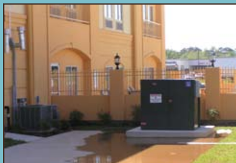
La Quinta Motel.