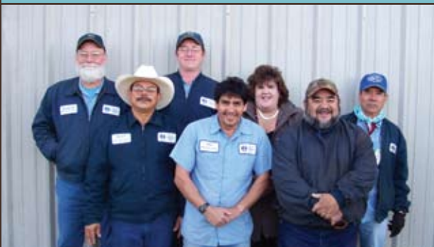
Parks and Recreation Department