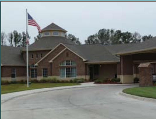
The Bradford at Brookside.