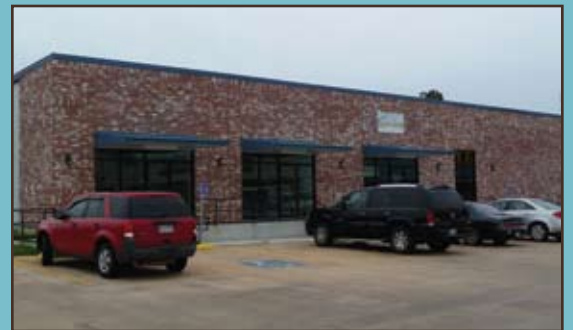
Jackson Enterprises Facility.