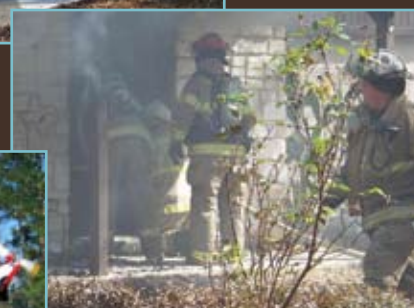
Firefighters answer the call of duty.