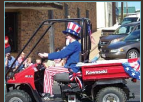
Red, White and Blue Parade.