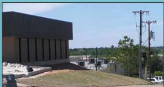
Southpoint Shopping Center.