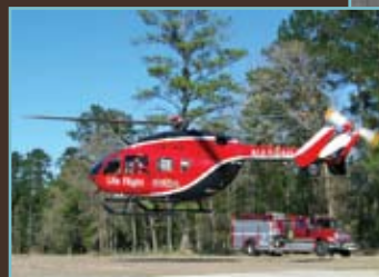
Firemen meet Memorial Hermann Life Flight.