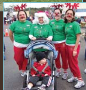
Participants at the Annual Jingle Bell Run.