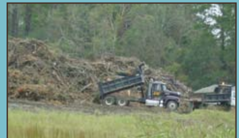
Hurricane Ike debris collected at Pedigo Park.